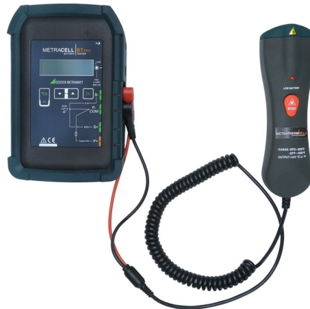
Figure 3: Battery tester with temperature sensor METRATHERM IR BASE (Z680A)