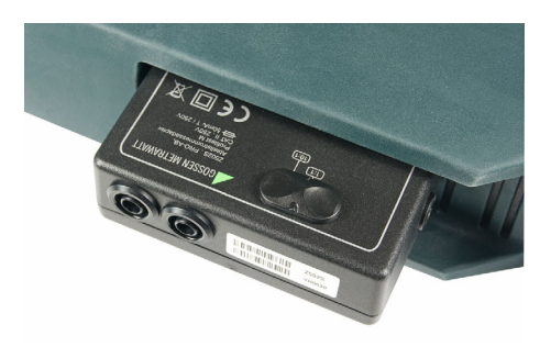
Figure 1: Leakage Current Measuring Adapter at the PROFITEST MXTRA

Before performing measurements, the adapter's measurement outputs must be plugged into the measurement inputs at the left-hand side of the PROFITEST MXTRA or SECULIFE IP (2-pole current clamp input and probe input).